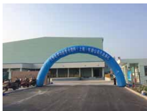
(left) Opening Ceremony (right) MFS plant

MFS is strategically situated in Eastern China and targets the capture of China’s rapidly growing automotive and packaging material markets. Leveraging the company’s advantages, this March the company commenced manufacture and sales of Milastomer™, a thermoplastic elastomer used in automotive window frames and as interior material, and Admer™, an adhesive polyolefin used in automotive fuel tanks and food packaging materials.